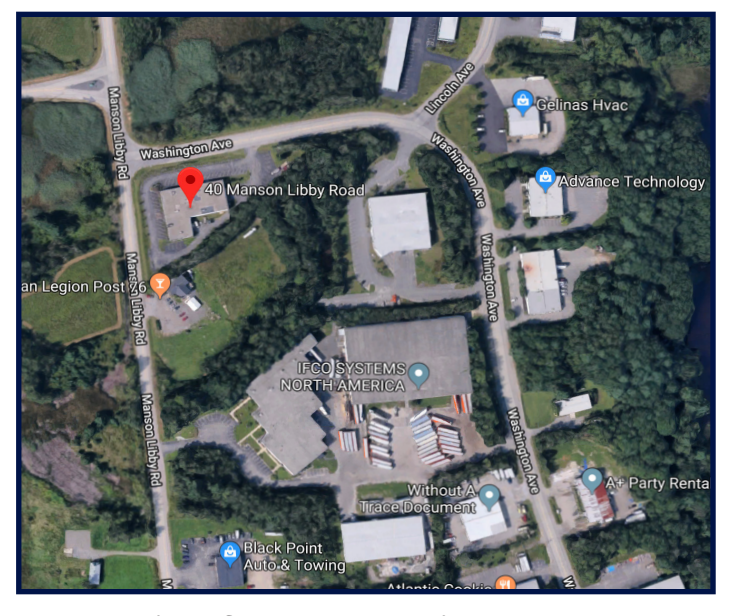
Aerial of 40 Manson Libby Road