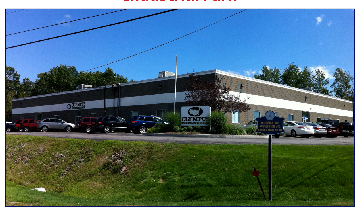
4,035 +/- SQUARE FEET OF OFFICE SPACE

Cardente Real Estate is pleased to offer 40 Manson Libby Road for Sublease. Conveniently located in the popular Scarborough Industrial Park, this 4,035+/-SF space is part of the 16,000+/- SF fleet building with a unique blend of appointed office space and modern warehouse space. This site has ample parking, excellent exposure to both Mason Libby Road and Washington Avenue with being just seconds to Route One and minutes from I-95 via Haigis Parkway. This space is ideal for a small business in need of inventory space. Contact Broker for further details.